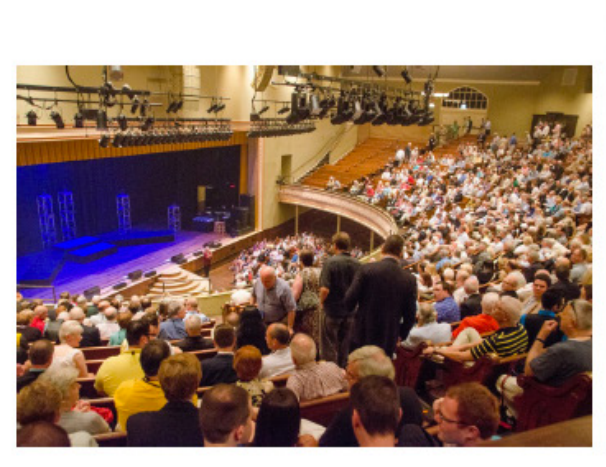
Ryman Auditorium hosts singers Straight No Chaser