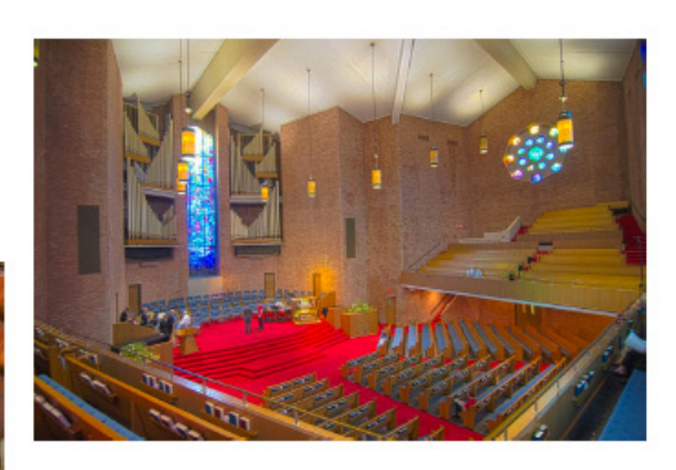
First Baptist Church, site of Cherry Rhodes and Trinity College Choir programs

Covenant Presbyterian, site of Choplin event